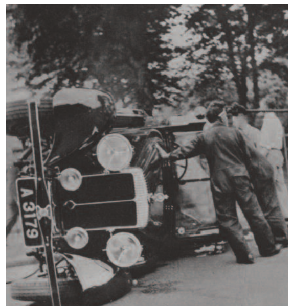
Queen Mary's limousine lying on its side in Wimbledon Park Road in May 1939.

Please make cheques payable to the 'Wandsworth Historical Society'.